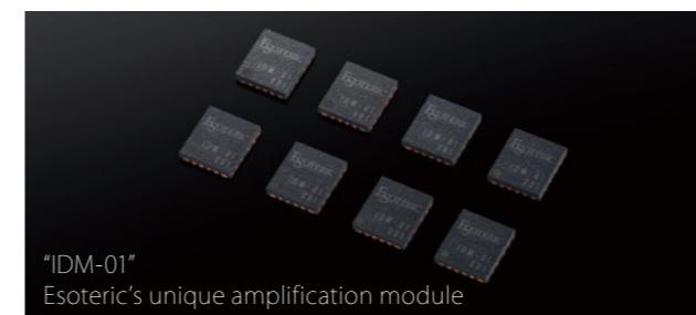
"IDM-01" Esoteric's unique amplification module

In the Grandioso D1X SE and Grandioso K1X SE, the FPGA algorithms and DAC circuit design were retained, but the discrete parts of the analog circuitry were brushed up to achieve an even higher level of sound quality with more vivid live sound, improved aural dynamics, and more organic texture.